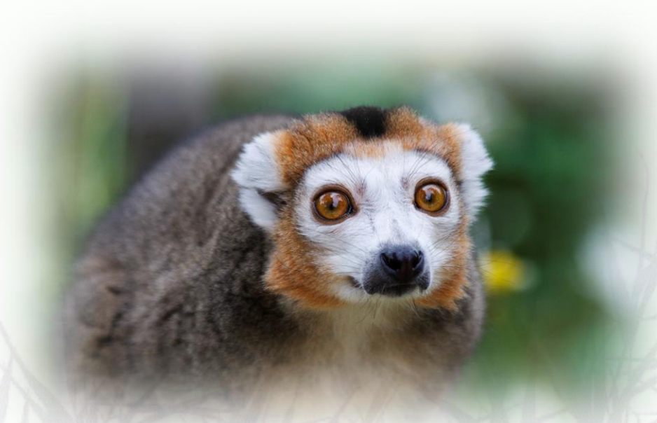
le lémurien à couronne