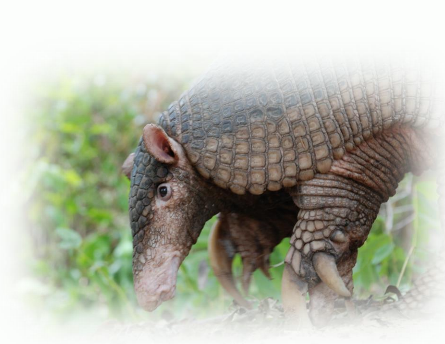
el armadillo gigante